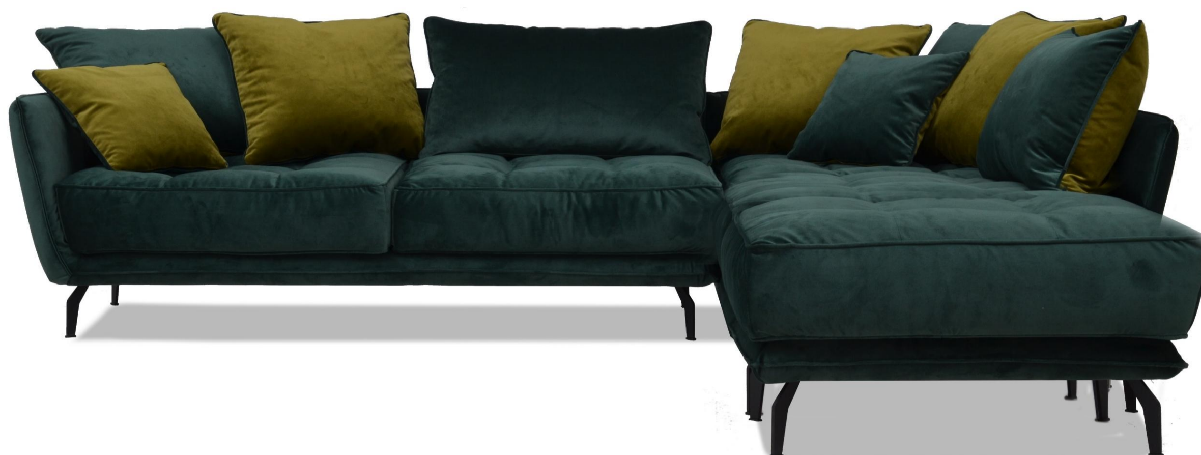
Combination Nr. 1